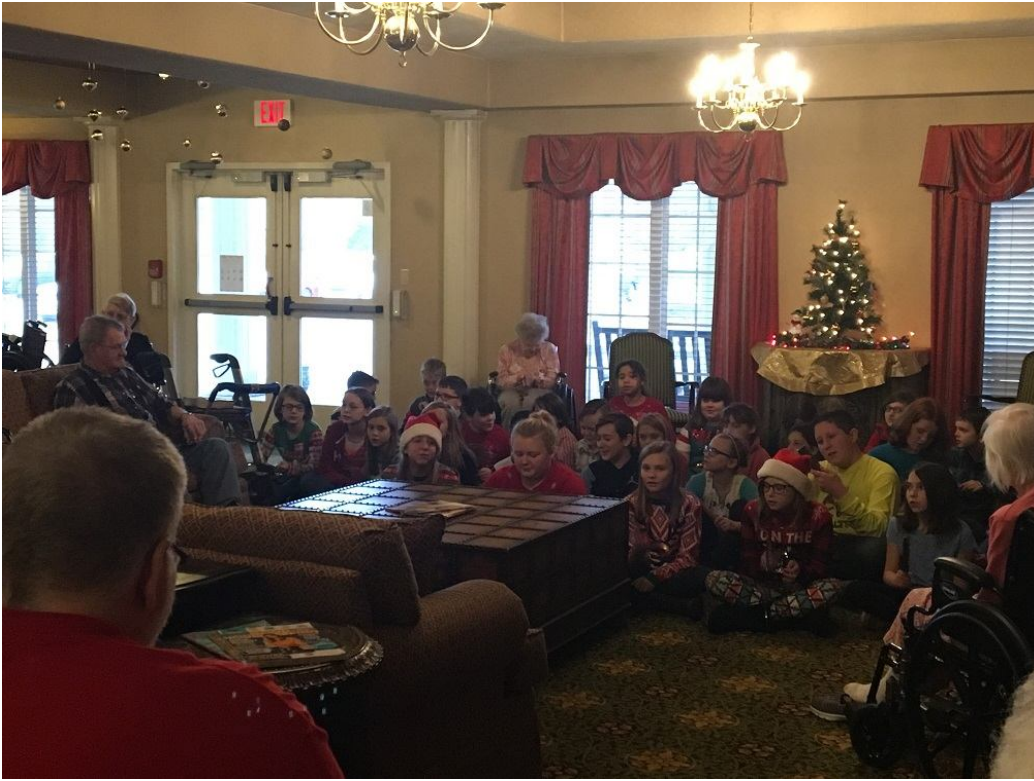
Our 5th grade recently visited residents at Mill Pond in Greencastle to spread some holiday cheer.